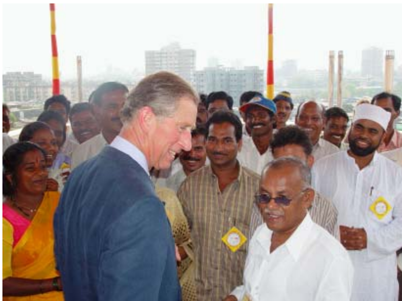
Prince Charles meets members of Mahila Milan and the National Slum Dwellers Federation to learn how they plan, implement and manage complex slum upgrading projects