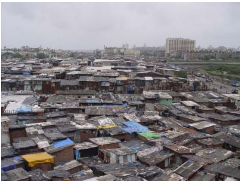
Slum areas like Dharavi (reputedly India's largest slum) are characterised by high density, poor housing and inadequate infrastructure